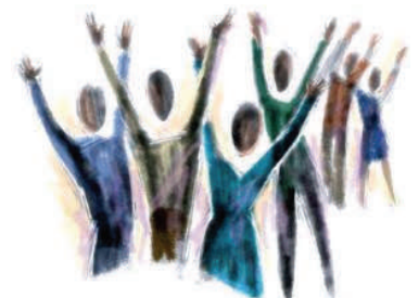
Praise the Lord

How, then, do we move from today's superficial concept of fellowship toward this deeper fellowship alluded to in the Bible?